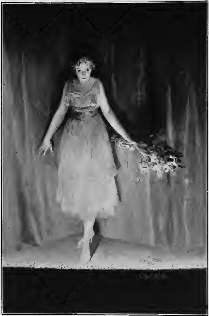
Her musical voice acted like a strange enchantment on the astonished audience.